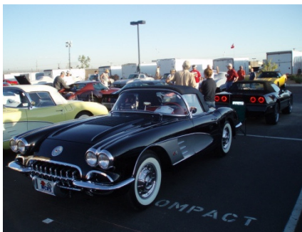
Albuquerque Meet - Bennett & Bergmann Cars