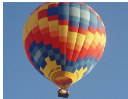
One of the many balloons - Albuquerque