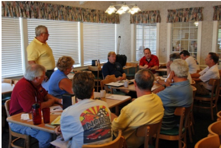
Regional Planning Meeting, September 2008