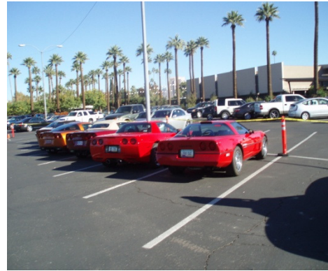
Figure 1 Parking at Christmas Party

All members welcome, your participation is needed