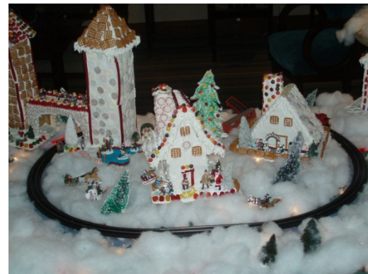
Figure 2 Gingerbread village in Phoenix Country Club