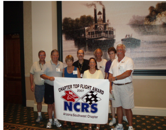
Top Flight Award, National Convention