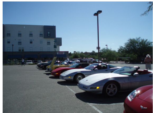
Parking for Cruise-In