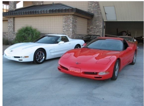
Stellar Air park, March 2008