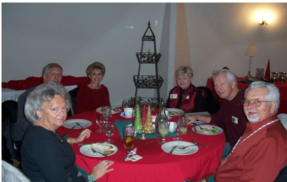
December Holiday Brunch