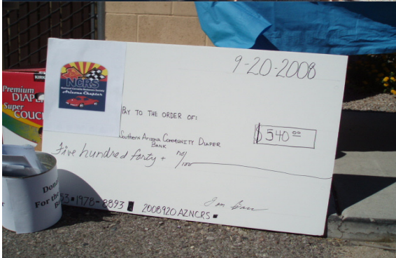
Charity Event, Sept 2008