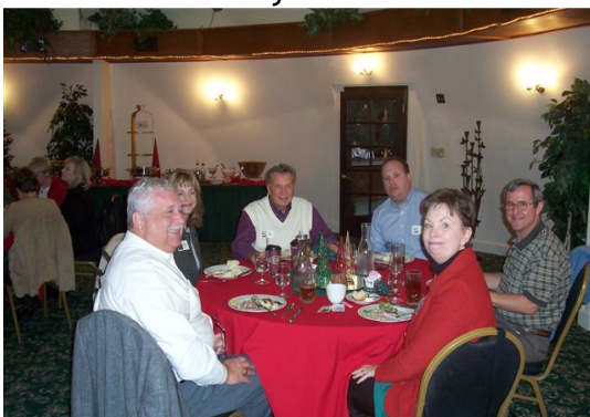
December Holiday Brunch