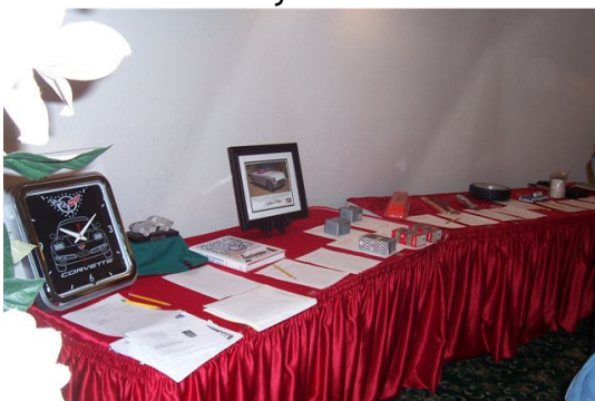
Silent Auction, December 2008