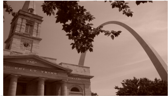
St. Louis Cathedral & Arch