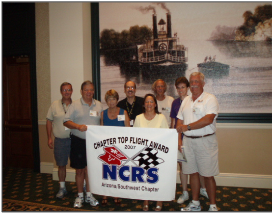
Arizona Members at Convention Top Flight Award