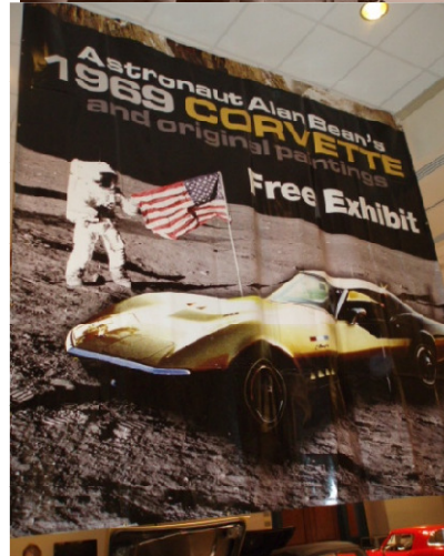
Banner & Car- Alan Bean's 1969 Corvette