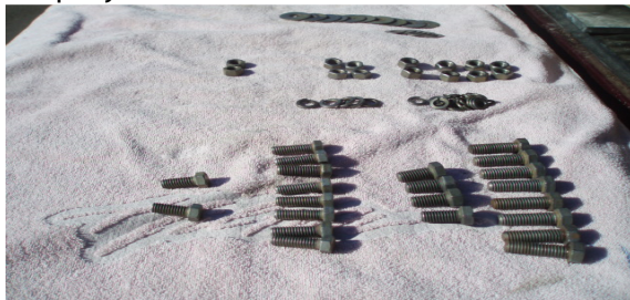
Figure 1 - Before

The kit I bought worked for approximately 4-5 batches. This was enough to do most of my chassis bolts. The purchased kit was less than the cost of one lot charge from a local plating company.