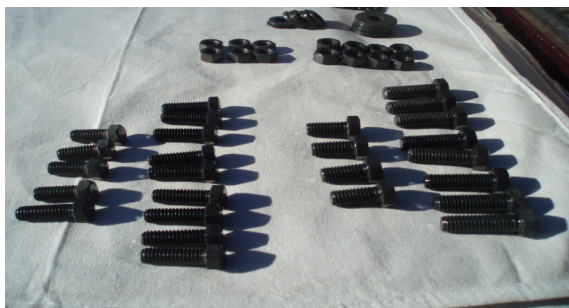
Figure 2 - After